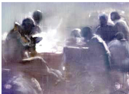
For some, metalworking plants once suggested this kind of imagery.

Early in my career I had no idea of the very complex nature of metalworking fluids and the many functions that these fluids are required to fulfill. Metalworking fluids must pro-